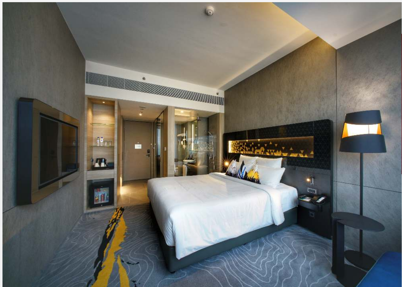
Novotel Singapore on Stevens

For more information, please visit: www.obes.sg